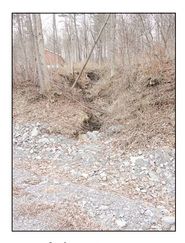
Surface water course