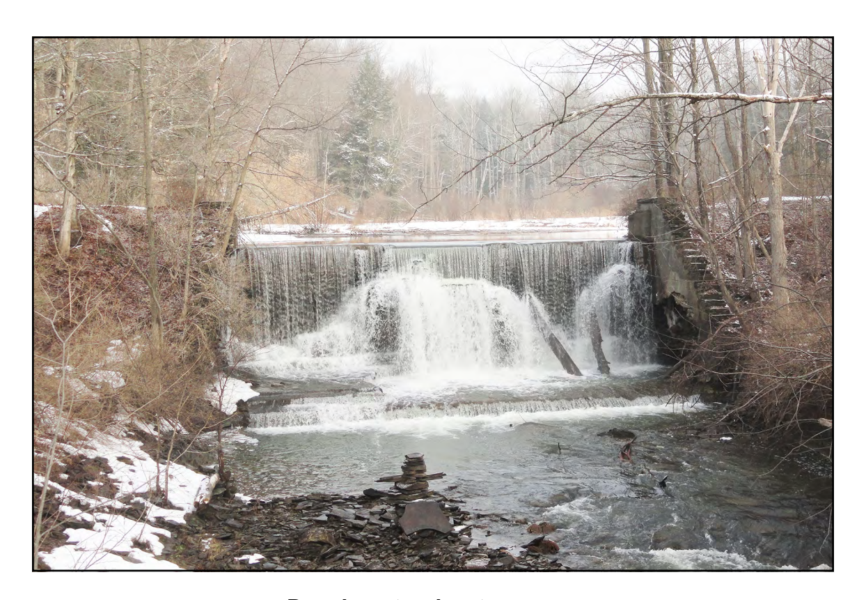
Dam in natural watercourse

A party built a dam in a large stream that was a natural watercourse. A very heavy rainstorm contributed to significant downstream flooding of numerous properties. The owners of these properties sought recovery of damages from the flooding by claiming that the owner of the dam negligently interfered with surface water. Can they recover such damages?