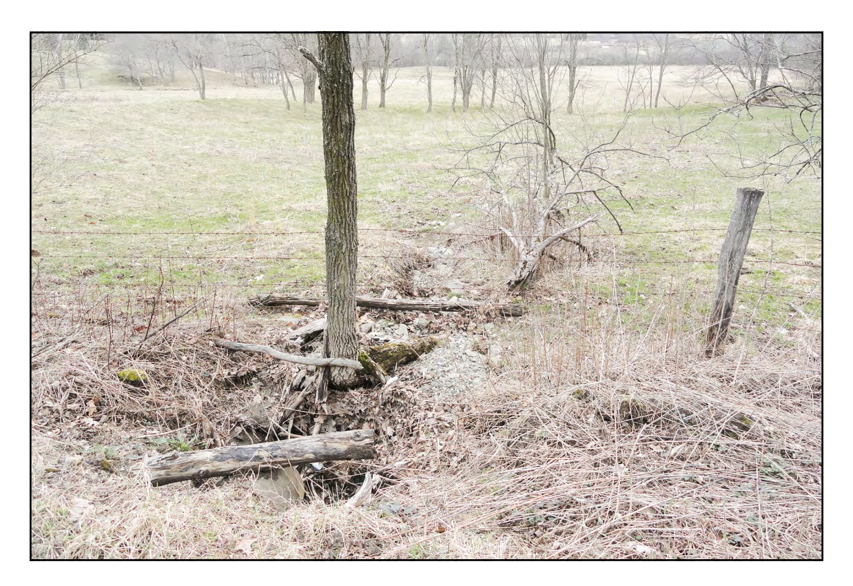
Unmaintained drainage ditch

The Town had a drainage ditch along a road that passed water across the road through a pipe and out into a field for many years (many more than 10). A drainage ditch appeared in and through the field, but the Town did no maintenance on it. The land owner of the field filled in the ditch where the water came out of the pipe under the road so that the drainage did not come out into his field. The fill was there for more than ten years. The Town decided to and did reopen the ditch. The land owner sued. Who would win and why?