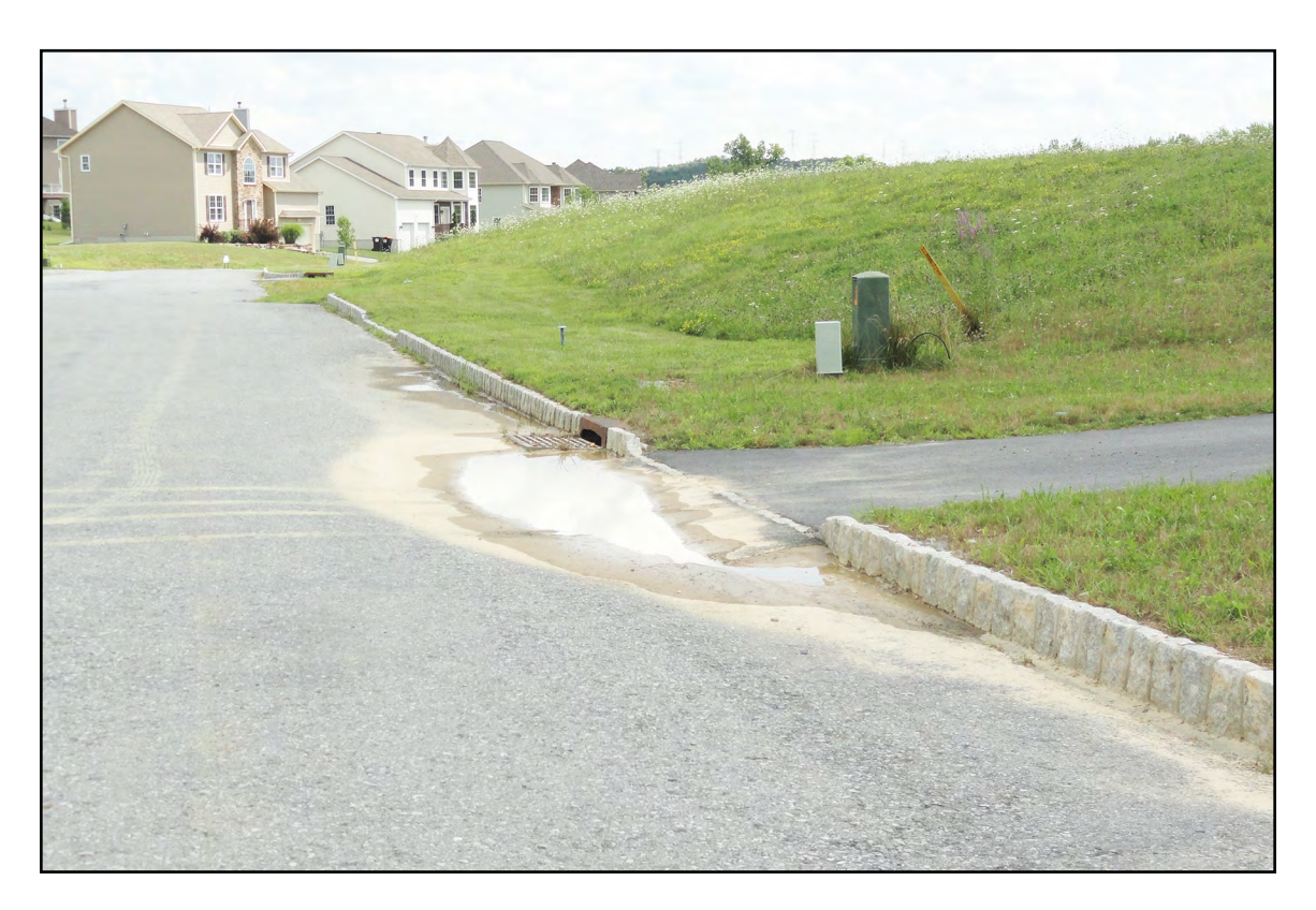
Discharge from higher driveway pouring onto road

In connection with building in a subdivision, a driveway connection has a garage that is much higher than the road so that the driveway was directly connected to the road. When it stormed, materials and debris would come down the driveway and onto the road. What could and should be done by the municipality in such situations?