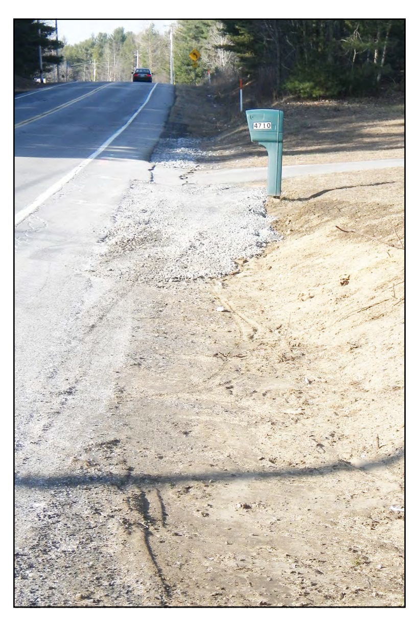
Ditch filled in to create driveway

There is a ditch along the side of a road that was constructed for drainage. The adjacent property owner wants to make a driveway connection to the road and he/she fills in the ditch where the driveway connection is made. Is he/she liable for damages from surface water back-ups?