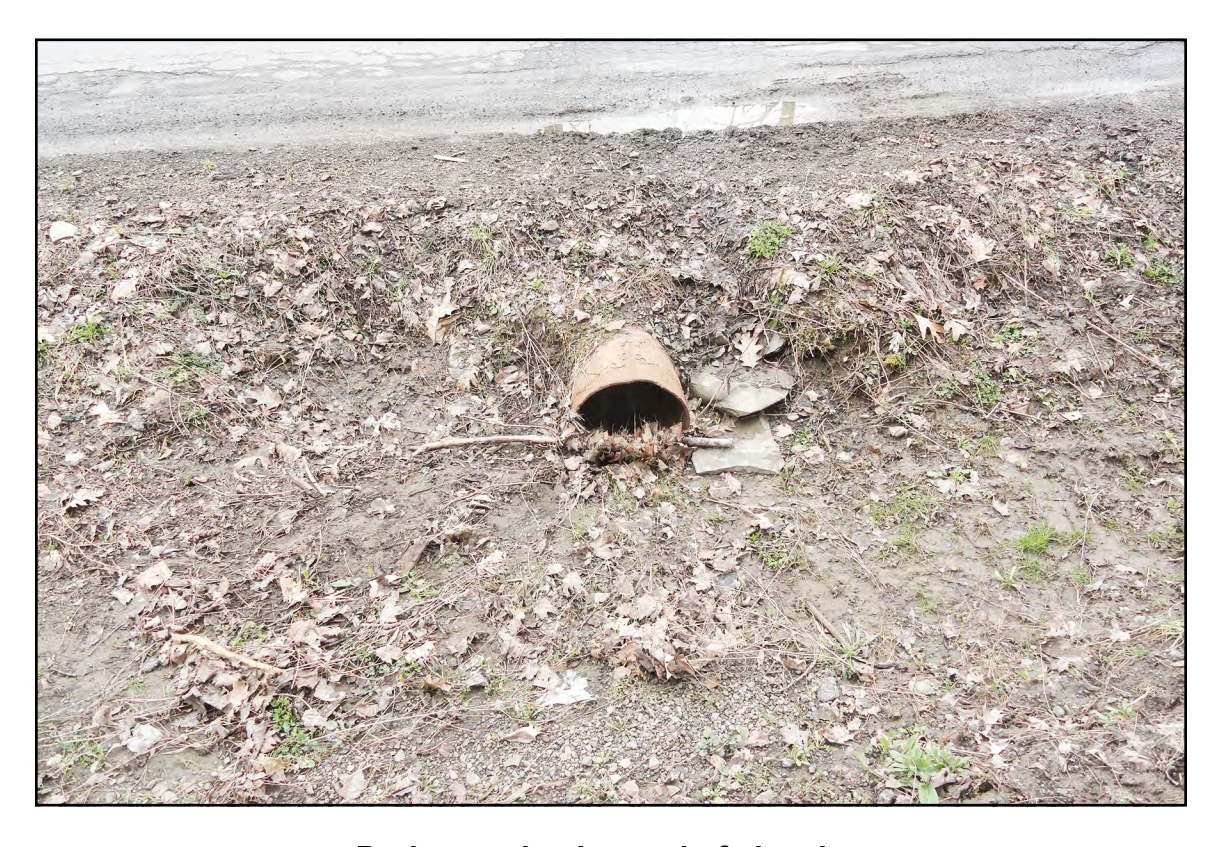
Drainage pipe in need of cleaning

Must the municipality clean their drainage ditches and/or pipes?