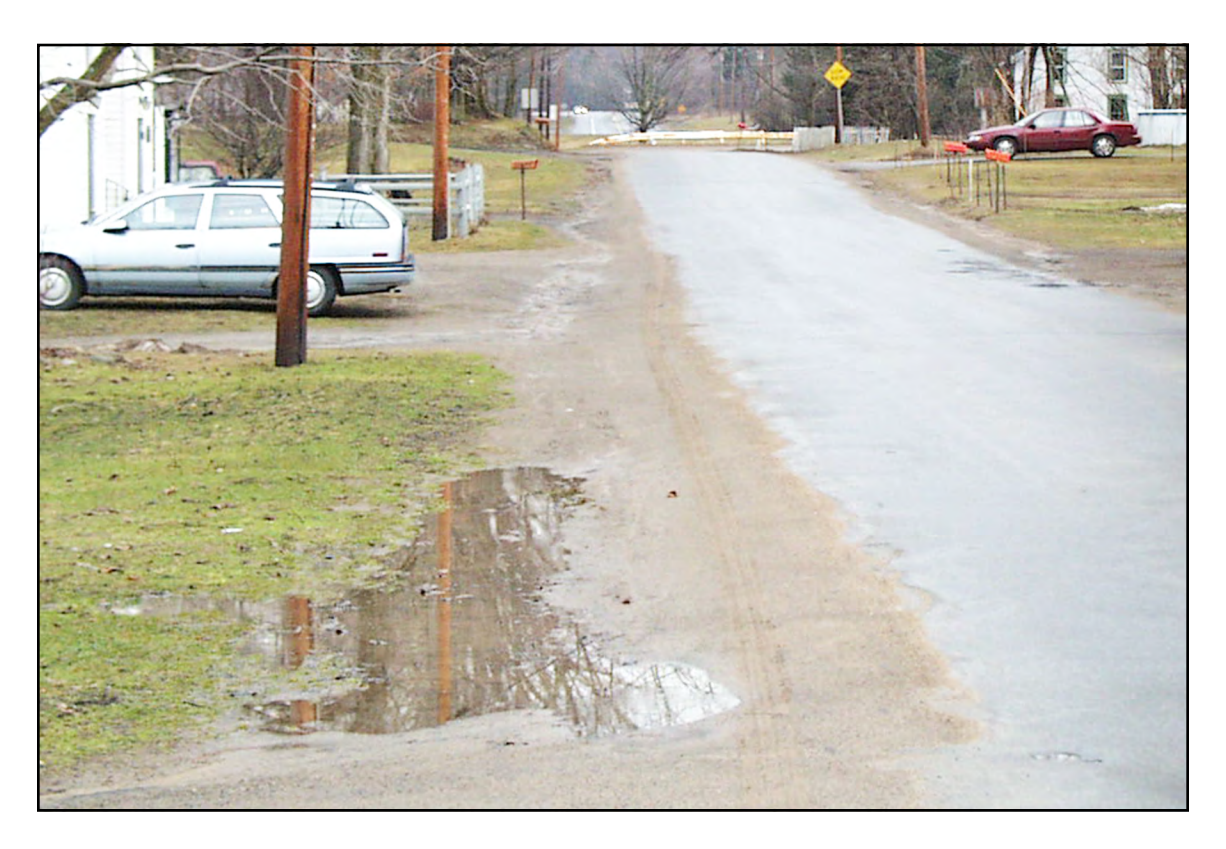
Raised street elevation causing flooding or retention of runoff

A Village raised the elevation of a street and as a result more surface water drained onto the adjacent property, but did not construct drainage ditches and/or trenches. The surface water from the street and other uplands had gone into a watercourse for many years, but had never overflowed the watercourse banks. In a very severe rain storm, shortly after the street was raised, there was flooding of the lower lands. Is the Village liable for the damages?