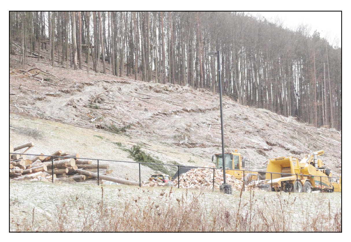
Upland property without ditches, trenches, or subsurface drainage

A upland property owner paved the area and created no ditches or trenches for the surface water runoff. Was the upland owner responsible for surface water damage to the lower lands?