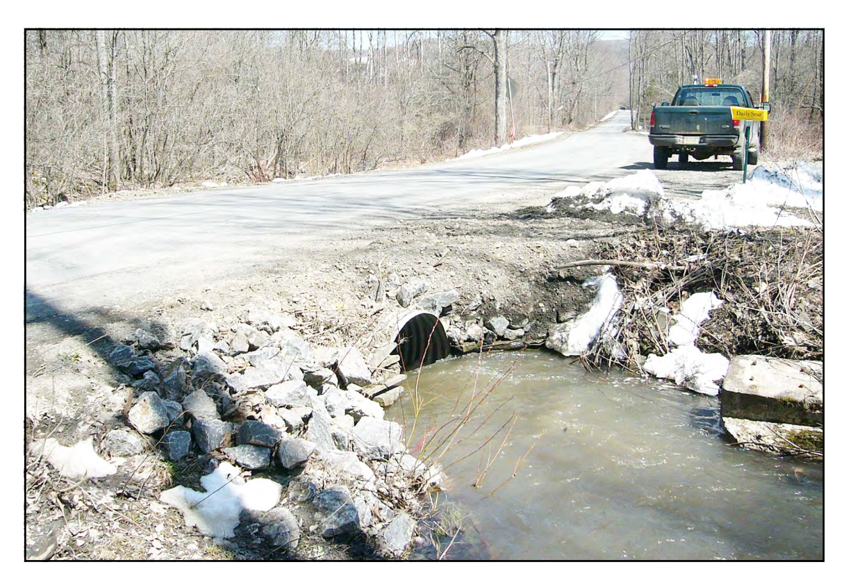
Roadway grade elevation increased, but culvert not changed

The State raised the grade of the highway and did not replace or reconstruct a culvert that had existed prior to the reconstruction. The old culvert had drained many of the upland properties, including the plaintiff's. The adjacent property owner filled in and graded his/her property. Prior thereto, the surface waters coming onto and gathering upon the lands had, to a great extent, been absorbed in the soil without much of the surface waters running off onto lower lands. Plaintiff's property was lower than the adjacent property and the highway. A flood occurred as a result of a heavy rainfall. The plaintiff claimed that the State was negligent for not replacing the old culvert. Did the plaintiff prevail?